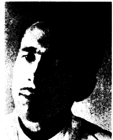
Antônio Villas Boas