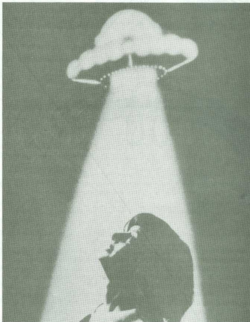
LIGHT FROM ABOVE —Some close encounter witnesses feel as if their alien contact has illuminated the future of mankind, and that they are to assist in some impending millennial transition.