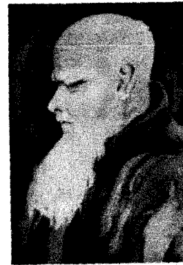
LAO-TSE or LAO-TZU

The story concerning this man is that he was of an English mother and an Indian father. He was born in 1848 in Dacca, Bengal Province. His family was extremely wealthy and owned a large estate just outside of Bombay. His father desired that he become a medical man and sent him to medical college at Oxford. But he was by nature a poet and philosopher and so after receiving his final degree in medicine to please his father, he suddenly disappeared. The story is that he spent about ten years traveling in the remotest regions of the world and studying as many of the religious and philosophical beliefs of man as he could lay his hand to. In 1915 he finally came back to his home in Bombay where he died confessing he had found no answer to life that could give him peace of mind; that all questions simply posed more questions and that all answers were simply personal opinions that said nothing. He now says the only answer to life as a whole is to question nothing - just BE, facing all situations with as much detachment as one can muster.