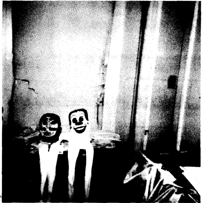
The Hallowe'en Masks