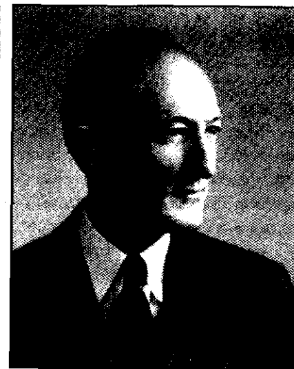
Maj. Donald E. Keyhoe

While these cases are admittedly very rare, they actually fit right into the pattern