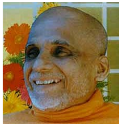
Sri Swami Krishnananda

SERVE, LOVE, GIVE, PURIFY, MEDITATE, REALIZE So Says Sri Swami Sivananda