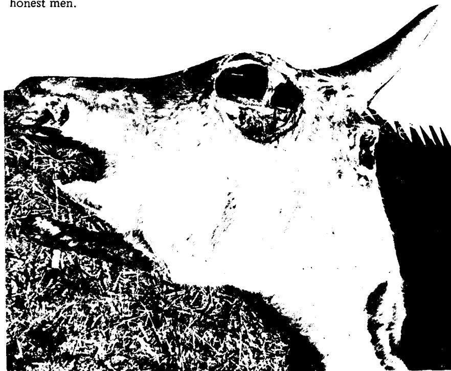
Colorado Country Life