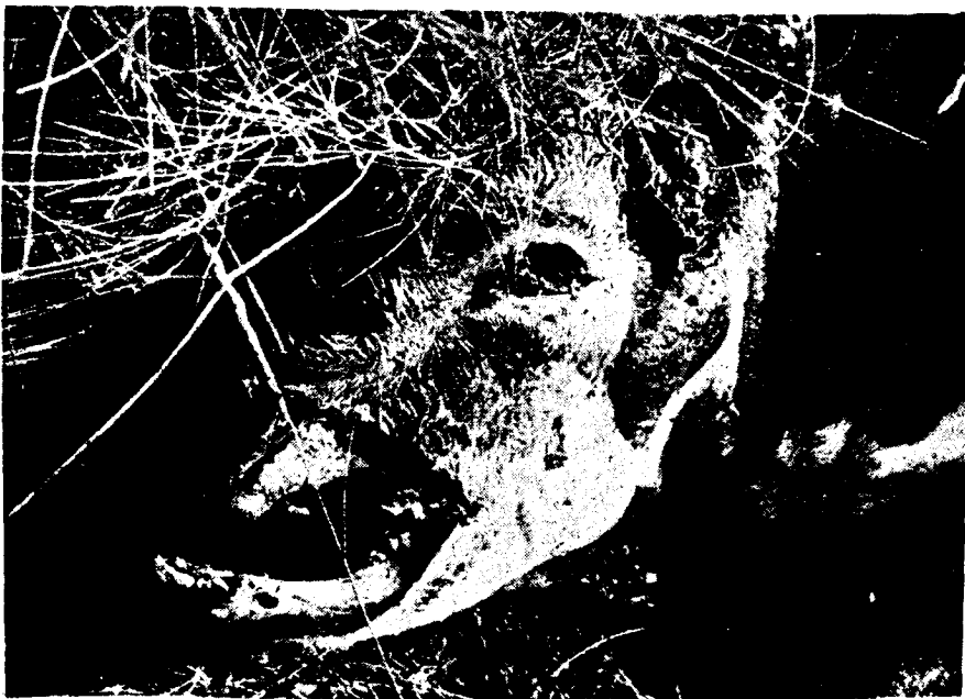
The Brush Banner

How can anyone tell the difference between predator damage and the surgically precise work of the phantom mutilators? Stockmen and sheriffs think they can immediately see the differences between that fantastically precise workmanship and the chewing, ripping and tearing predator damage that most of them have seen dozens or maybe even hundreds of times before. During the summer while the CBI was still very naive and honestly perplexed about what was going on here, the "experts" were saying that too. The best way to tell predator damage from a man-made mutilation is by simple visual observation. 42