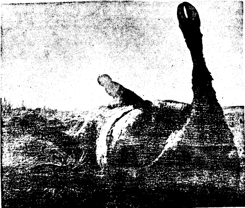
Ranchland Farm News

The udder was obviously removed from this cow by Eagles. Even though they do dastardly things, and are pre-daters, nevertheless they have powerful friends in Washington and San Francisco who protect them. No photograph can possibly do justice to the skill with which the Eagle family works, Goldy and Baldy, but especially the brothers, Lone and Legal. Legal can take the hide off quickly and expertly, as all his victims learn by sad experience. When they are examined under a microscope the teeth marks of those notorious pre-daters are easily identified.